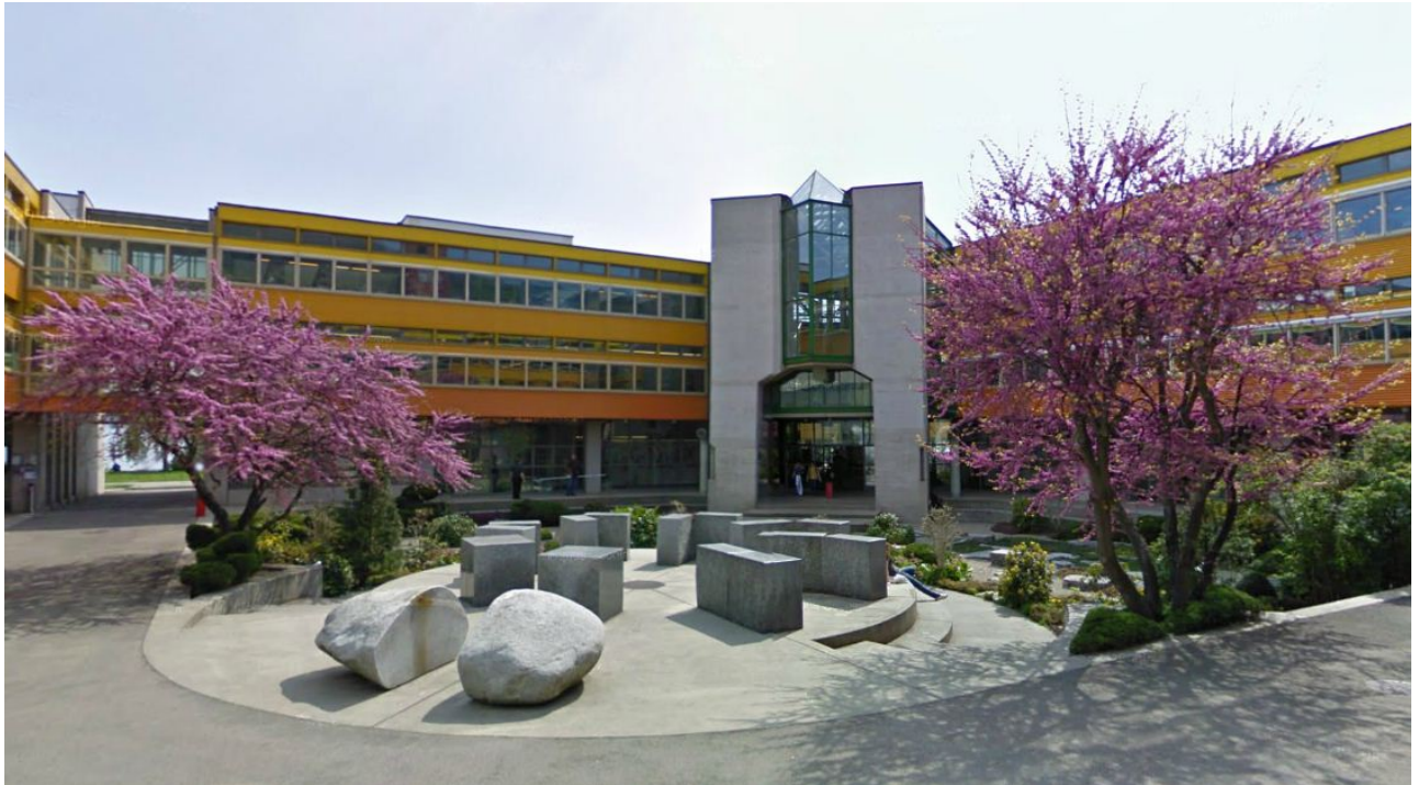
Picture of the building at Espace Tilo-Frey 1, main entry.